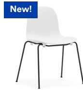
Form Chair stacking