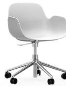
Form Armchair swivel 5W gaslift