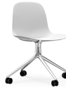
Form Chair swivel 4W