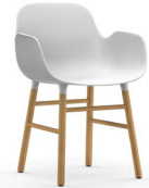
Form Armchair wood