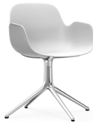
Form Armchair swivel 4L