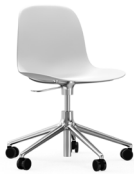
Form Chair swivel 5W gaslift