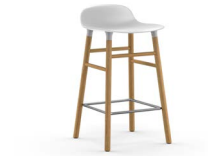
Form Barstool 65 cm wood