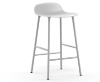
Form Barstool 65 cm steel, chrome, brass