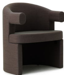
Burra Chair H: 77,5 x W: 69 x D: 61 x SH: 45 cm

Upholstery: All colors in Kvadrat Remix, Kvadrat Canvas, Kvadrat Steelcut Trio, Kvadrat Hallingdal, Kvadrat Divina, Kvadrat Divina MD, Kvadrat Divina Melange, Kvadrat Fiord, Kvadrat Vidar, Kvadrat Sacho Elle, Kvadrat Sacho Zero, Camira Oceanic, Camira Aquarius, Camira Main Line Flax, Camira Synergy, Camira Yoredale, JAB City Velvet and Sørensen Ultra Leather.