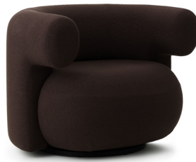
Burra Lounge Chair Swivel W. Return H: 72,5 x W: 95 x D: 79,5 x SH: 42,5 cm