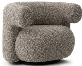
Burra Lounge Chair Swivel H: 72,5 x W: 95 x D: 79,5 x SH: 42,5 cm