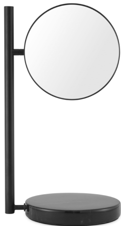
Pose Mirror Black