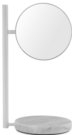
Pose Mirror White