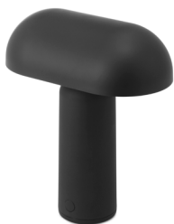
Porta Table Lamp Black H 23,5 x W 20,2 x D 11,2 x Ø 6,5 cm