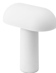
Porta Table Lamp White H 23,5 x W 20,2 x D 11,2 x Ø 6,5 cm