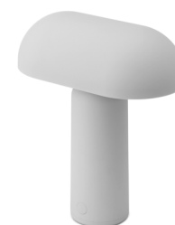
Porta Table Lamp Grey H 23,5 x W 20,2 x D 11,2 x Ø 6,5 cm