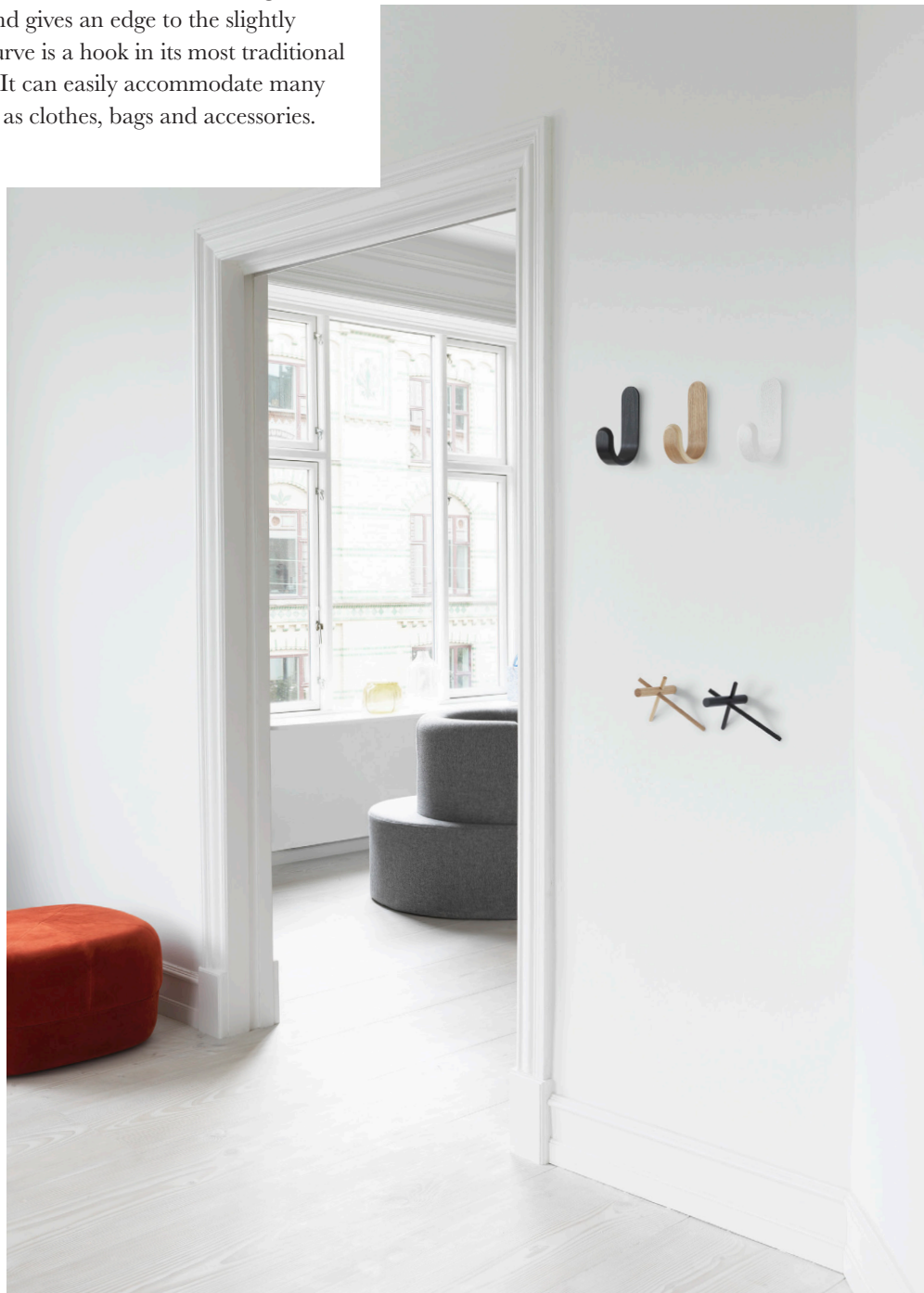
Curve hook in black, ash and white, shown with Sticks hooks and Circus pouf

The Danish designer Peter Johansen has created a wooden hook in a contemporary design, with references to the classic Danish design of the '50s. The Curve hook has the classic, uncomplicated, and intuitive shape of a hook. The faceted rounding breaks up the simple feel and gives an edge to the slightly oversized design. Curve is a hook in its most traditional and symbolic form. It can easily accommodate many kinds of items, such as clothes, bags and accessories.