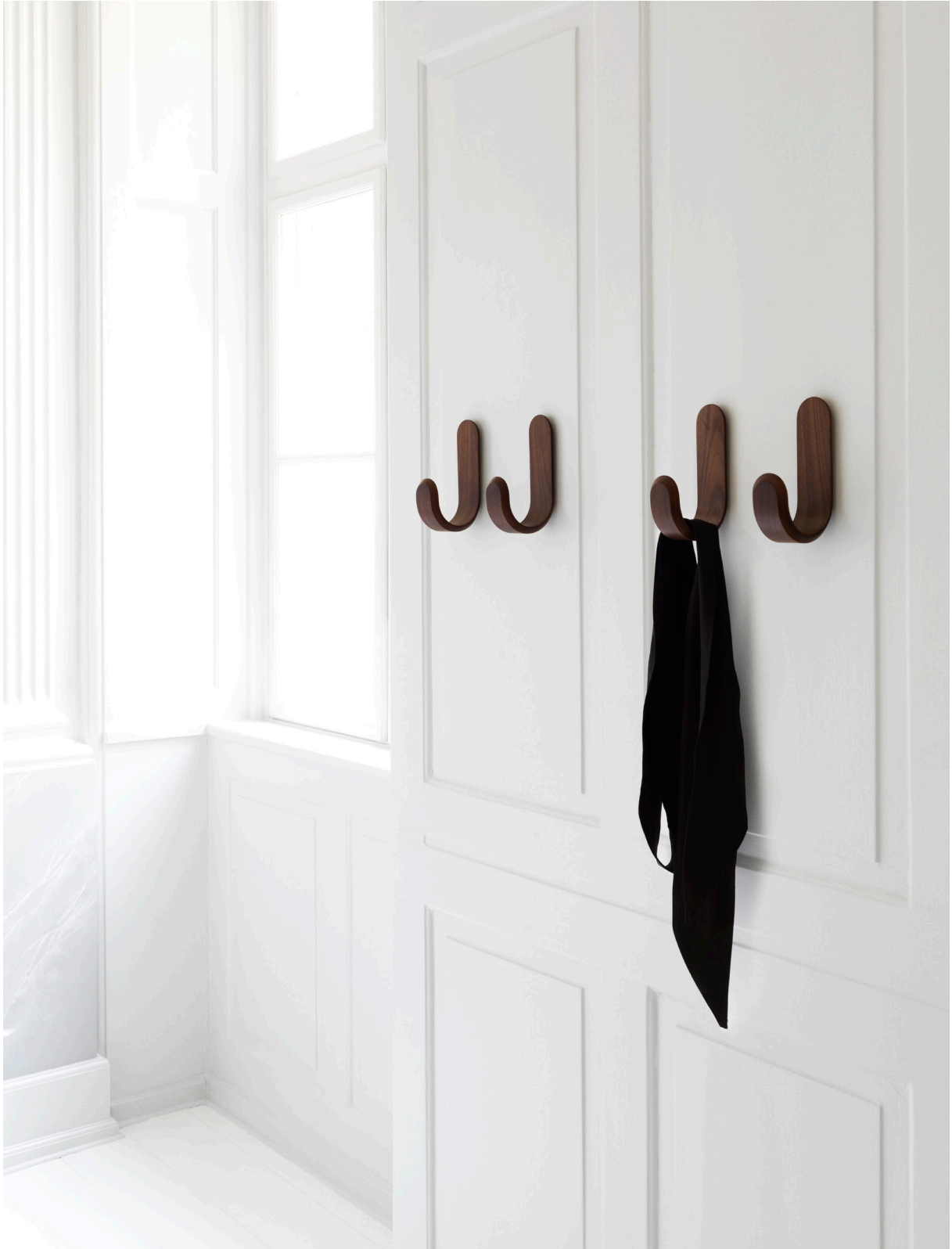
Curve hook in walnut