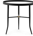
Lug Table Small