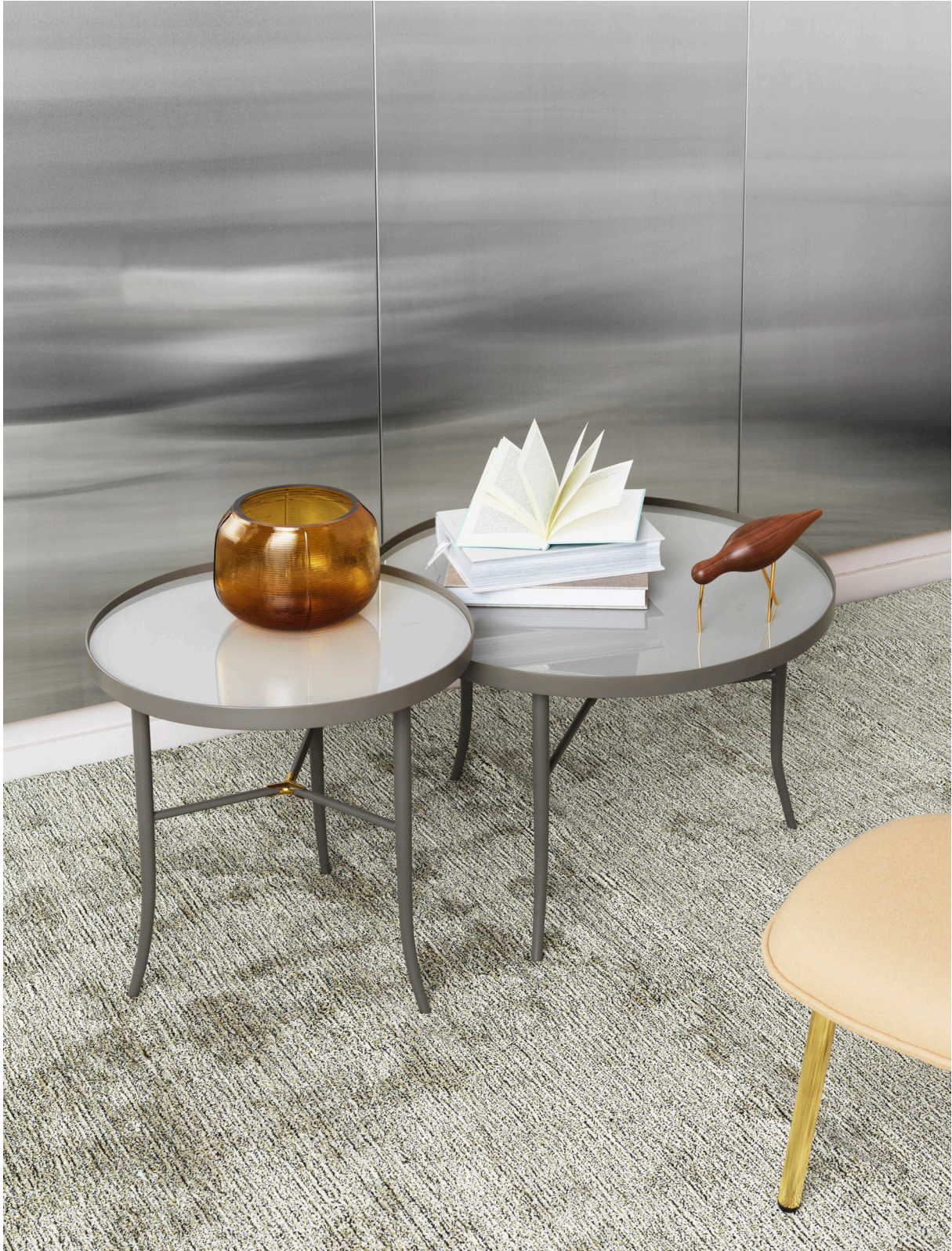
Lug table small and large in gray