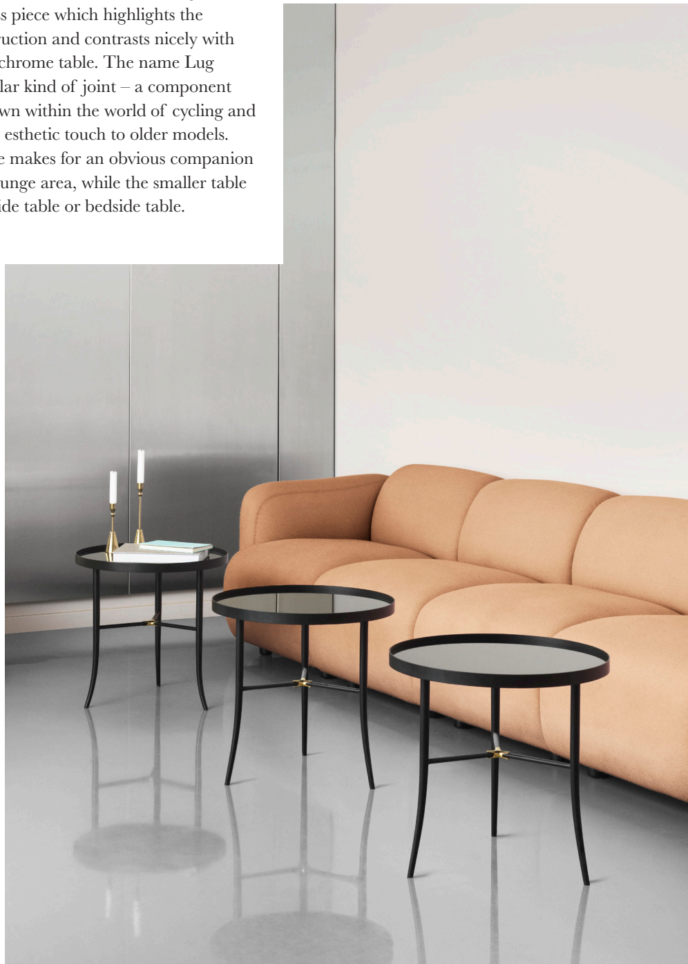
Lug table small in black, shown with Swell sofa

The steel parts of vintage bicycles have provided inspiration for the design of the Lug table's simple steel frame. Its slender, slightly curved table legs emulate the front fork of a bicycle, almost giving the impression of a table in motion. The frame is joined by a prominent brass piece which highlights the honesty of its construction and contrasts nicely with the otherwise monochrome table. The name Lug refers to this particular kind of joint – a component that is very well known within the world of cycling and which often adds an esthetic touch to older models. The larger Lug table makes for an obvious companion piece to sofas in a lounge area, while the smaller table is appropriate as a side table or bedside table.