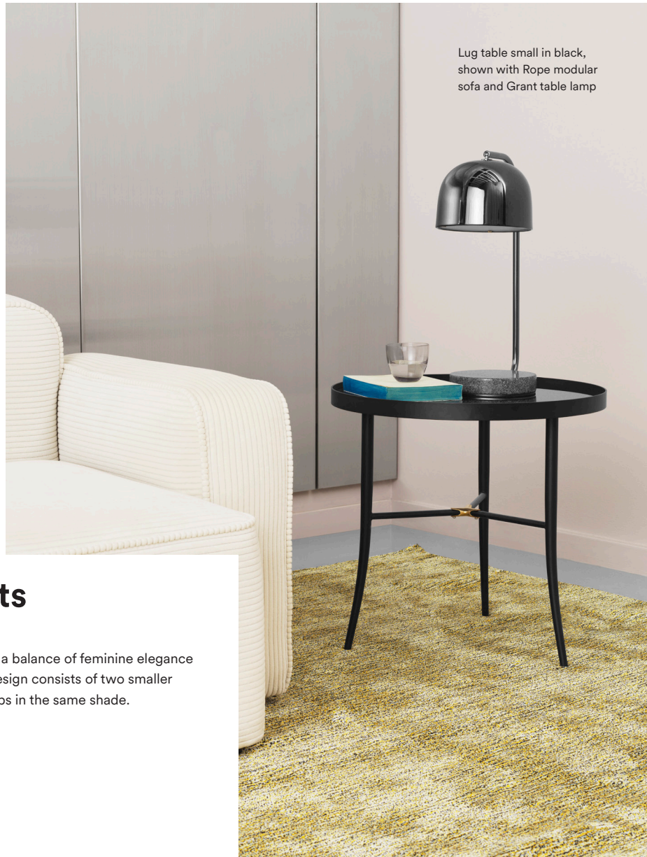
Lug table small in black, shown with Rope modular sofa and Grant table lamp