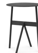
Stock Table H: 46 x D: 37,5 x Ø37 cm