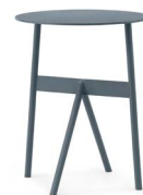
Stock Table H: 46 x D: 37,5 x Ø37 cm