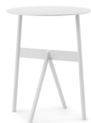
Stock Table H: 46 x D: 37,5 x Ø37 cm