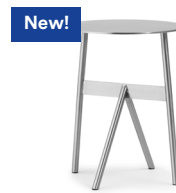
Stock Table H: 46 x D: 37,5 x Ø37 cm