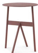
Stock Table H: 46 x D: 37,5 x Ø37 cm