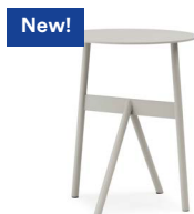
Stock Table H: 46 x D: 37,5 x Ø37 cm